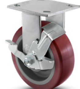
BRK7 Rigid Brake available on 4", 5", 6" and 8" rigid models