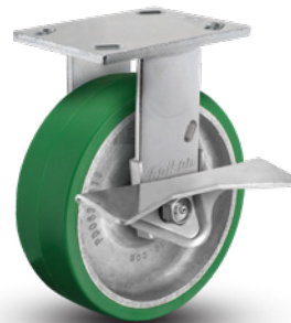
BRK3 Rigid Brake available on 4", 5", 6" and 8" rigid models