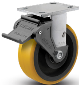
BRK2 Rigid Brake available on 6" rigid models

Colson Brake Kits should be used with the new CG-RIGID models if a brakes are desired. Specify BRK3 and BRK7 . The 6" Rigid Tech Lock BRK2 also works (see photos below)